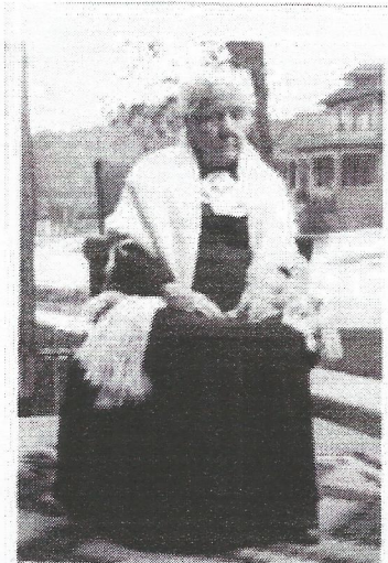
First Lady of the Church