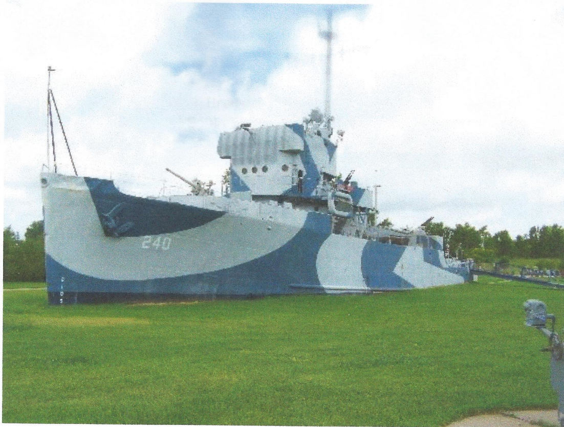
USS Hazard, today, in "dry dock" in Omaha, Nebraska