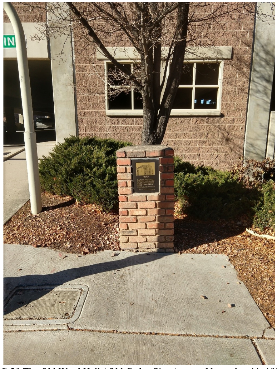
CC-20 The Old Ward Hall / Old Cedar City Armory November 11, 1985