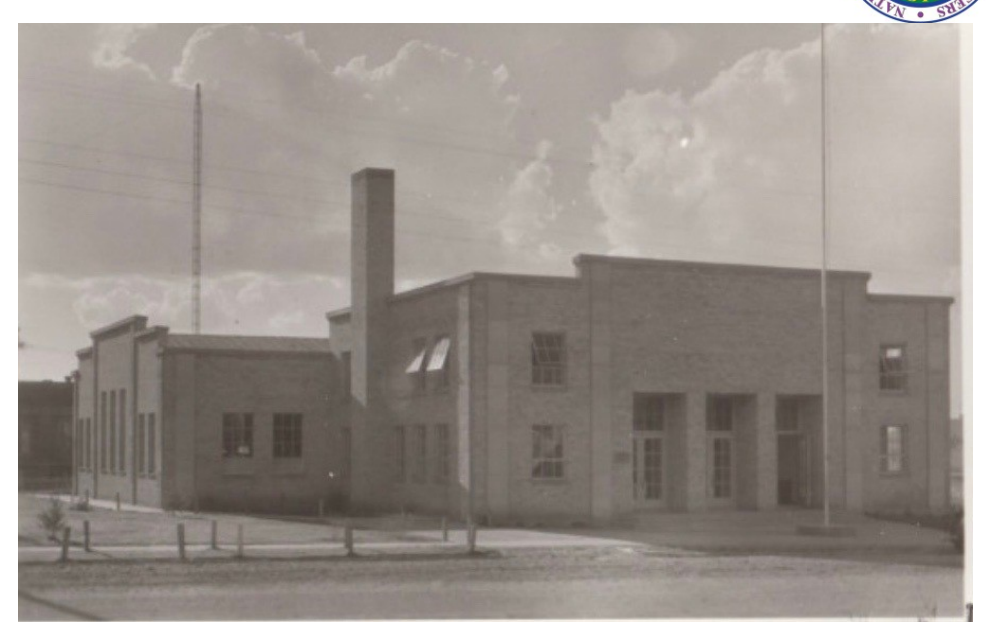
Old Cedar City Utah National Guard Armory 1937 to 1978

During the 1930's, Utah National Guard (UTNG) used federal money, often supplied through the Works Progress Administration (WPA), to build or expand a number of UTNG facilities. The WPA funded eight armories and several garage and storage areas for the UTNG. By1940, 13 armories were in use by the Utah Guard including that in Cedar City. The building has since been demolished, and a new UTNG building was built at the location of Kitty Hawk and Airport Dr. in Cedar City.