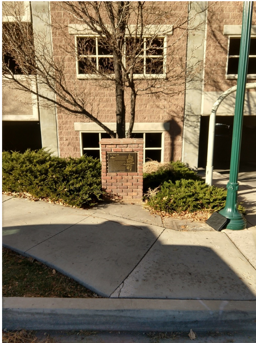
C-19 The Social Hall Monument

Longitude: -113.060111; Latitude: 37.678611; Elevation 5851'; CC-19 The Social Hall, 100 E by parking lot