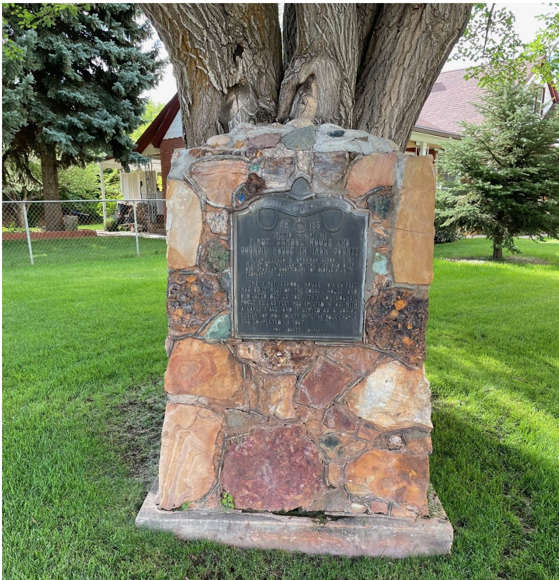
Daughters of Utah Pioneers #135 Erected September 1949 by Iron County Company

Longitude: -112.827222; Latitude: 37.840278; Elevation 6,030'; DUP_135 Prwn-2 First School House