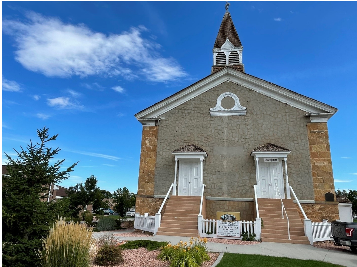
Daughters of Utah Pioneers #168 erected 1951 Old Rock Church and D.U.P. Relic Hall

Longitude: -112.829167; Latitude: 37.841111; Elevation 5,540'; DUP_168; Prwn-1 Old Rock Church