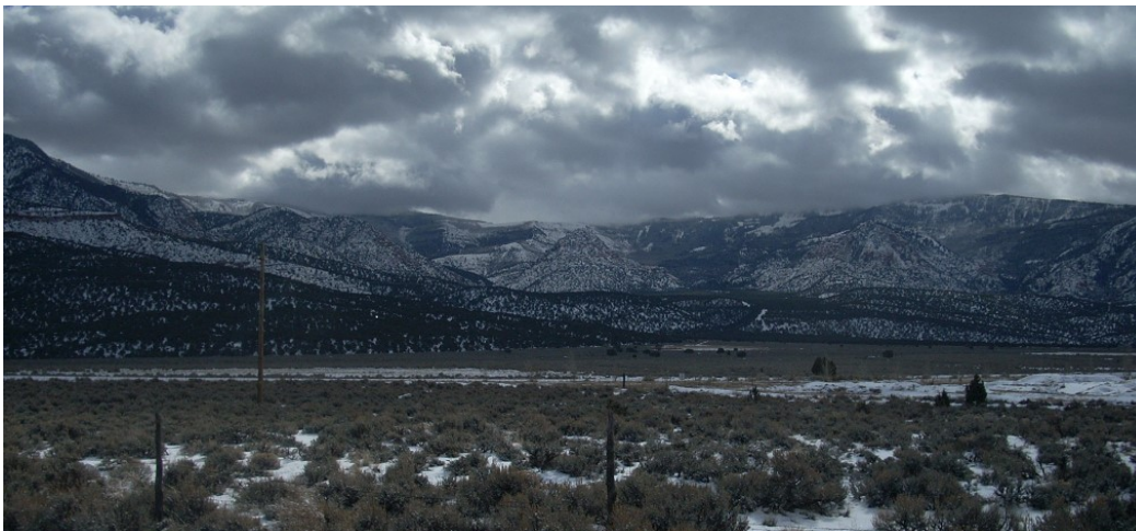
Shirts Canyon in the Winter

Original ownership of Hamilton Fort, with letter seeking to return the proper name to Shirts Canyon