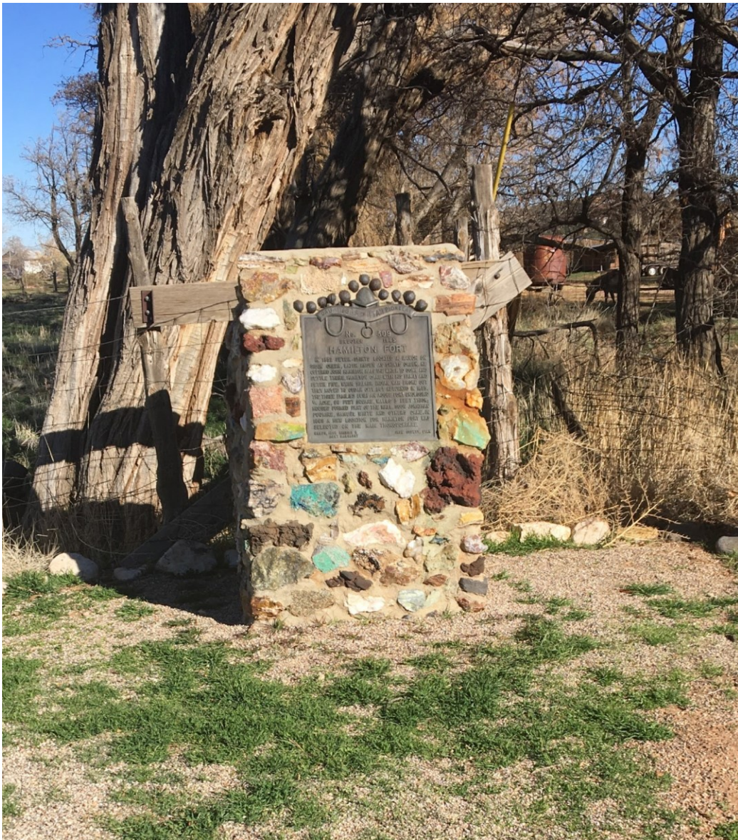
DUP-309 CC-10 Monument erected in 1965 Commemorating first families at Hamilton Fort

Longitude: -113.131944; Latitude: 37.628333; Elevation 5,670'; DUP-309_CC-10; Hamilton Fort