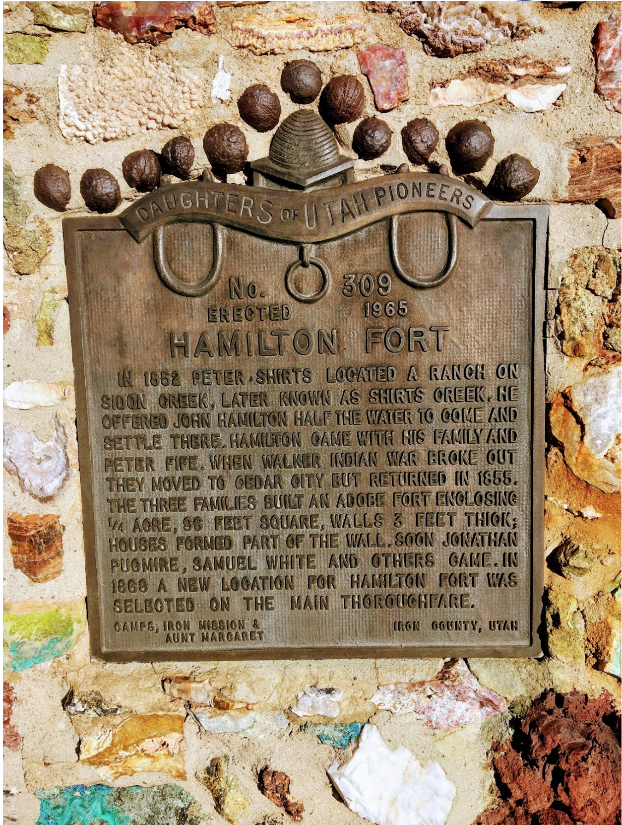
Close up on the Hamilton Fort Plaque