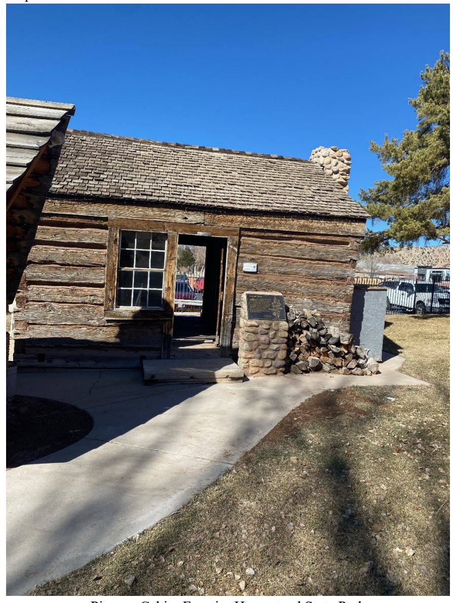
Pioneer Cabin, Frontier Homestead State Park