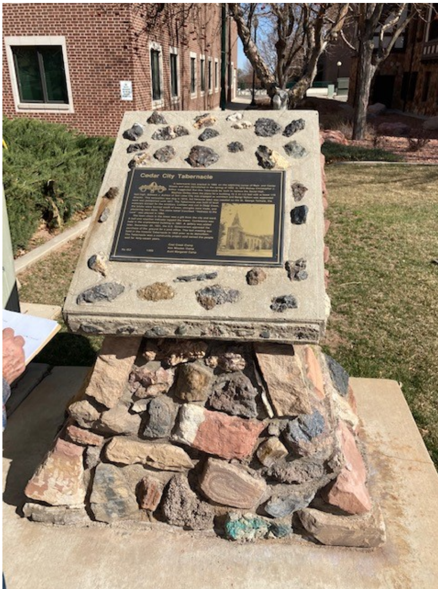
Cedar City Tabernacle Monument between the City Building and the Old Rock Church on Center Street.

Longitude: -113.060833; Latitude: 37.6775; Elevation 5,850'; DUP-452; CC-1 Tabernacle