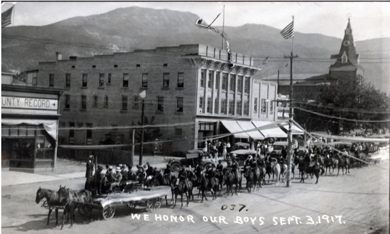
Homecoming from World War I, 03 September 1917, passing the Cedar City Tabernacle.