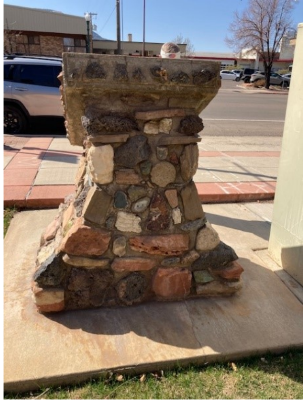
North side of the Monument