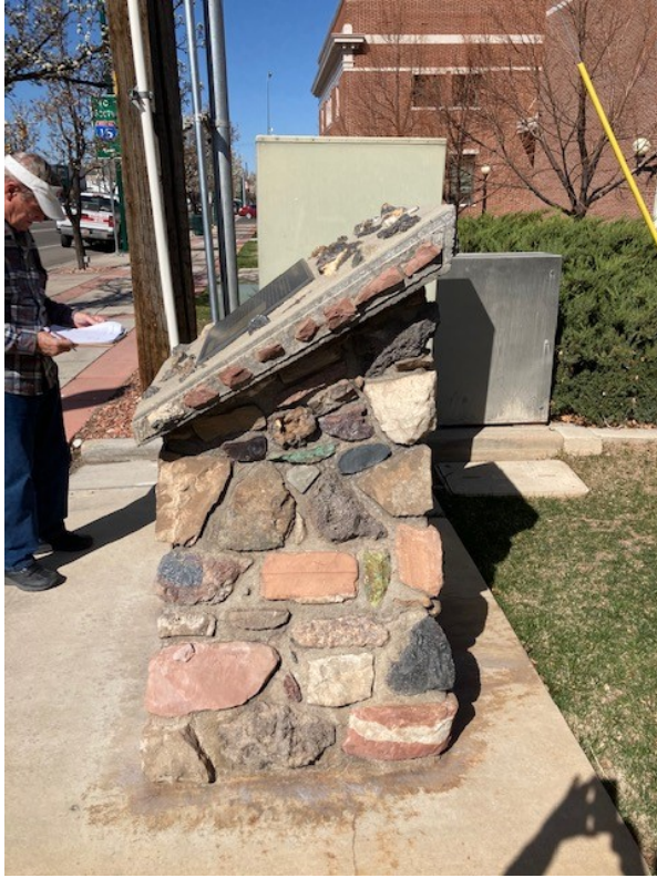
East side of the Monument