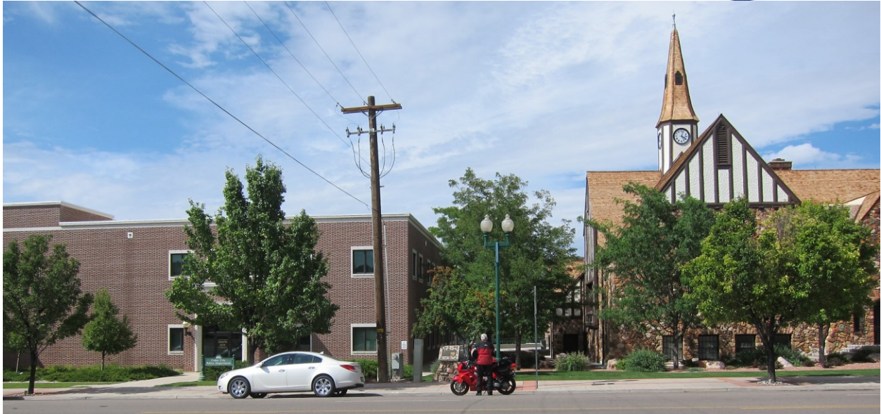
Looking at Cedar City Tabernacle Monument from the south side of Center Street.