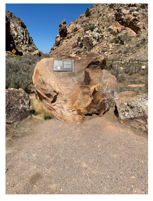
Southern Utah Expedition of 1849/" Gods own House" - Parowan Gap

The prehistoric design on the rocks in this area are called petroglyphs. They were made approximately 1000 years ago either by ancestors of the present-day Southern Paiute or by people of the Sevier Fremont culture. The designs do not signify exact words of any language, and thus, are not Hieroglyphs. Although several theories have been expressed the exact meaning of the designs is still unknown.