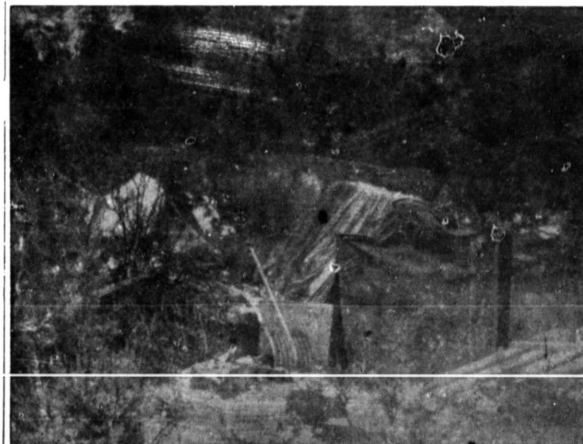
DUGOUT TENT. This is one of the individual tents at the campsite. Smoke from the stove is shown coming from the chimney in back. In the left background is another of the tents, nearly hidden in the heavy cedars.