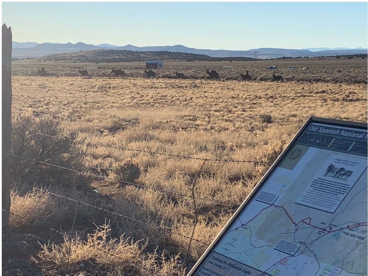
30"x30" metal frame with interpretative plaque, and 8 near life size ack mule silhouettes.

Longitude: -112.981667; Latitude: 37.7825; Elevation 5860'; SUP_259; OST-4A Summit and Enoch W I-15