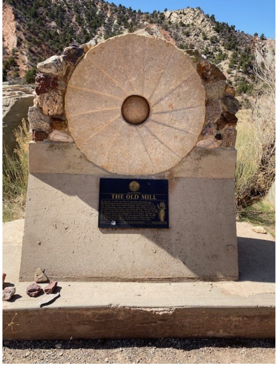
The Old Mill Monument before enhancements

Longitude: -113.043806; Latitude: 37.67275; Elevation 5,948'; SUP-8 CC-18; The Old Mill