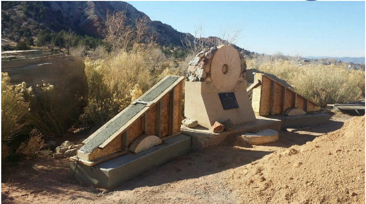
Enhanced Old Mill Monument before cement forms taken off