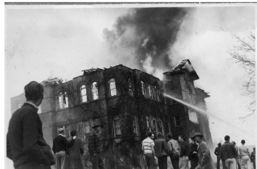
Old Main at the Founding Old Main Fire 13 August 2015