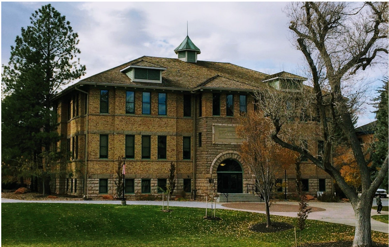
Old Main, first building built on BNS/BAC Campus, later CSU, then SUSC, and now SUU Campus.

Longitude: -113.068333; Latitude: 37.676111; Elevation 5,850'; SUU_CC-7; 395 W 75 South Cedar City