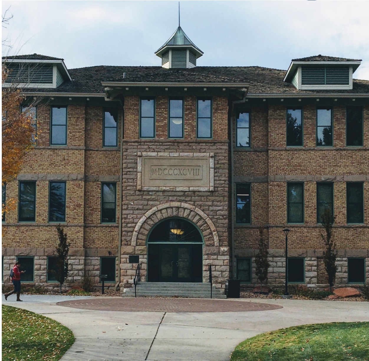
Front Entrance to Old Main on SUU Campus