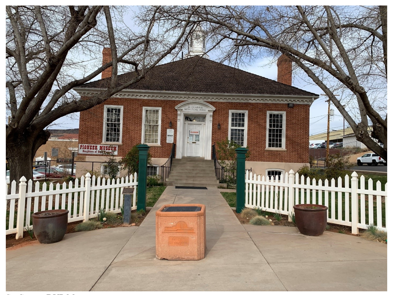
St. George DUP Museum