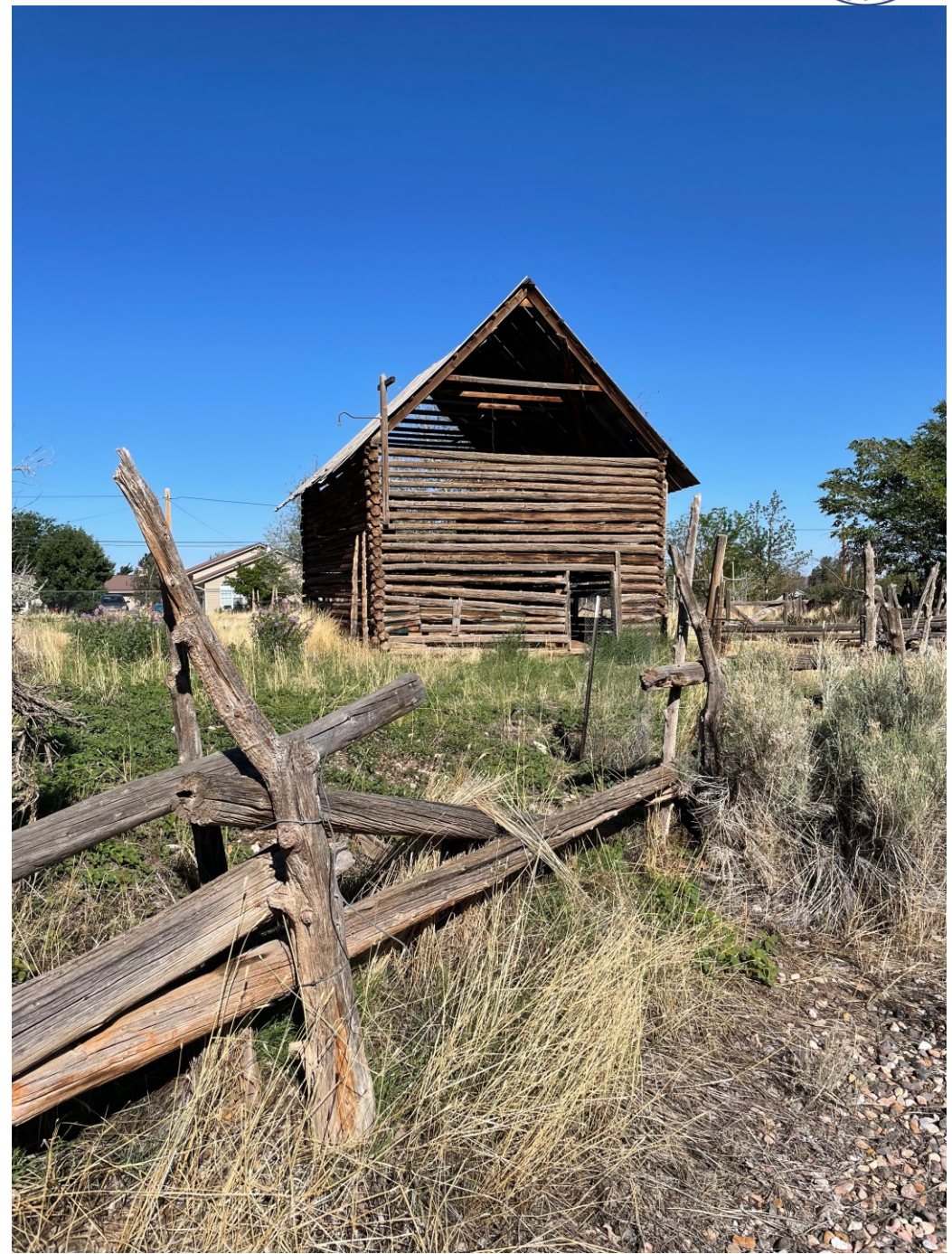
In 1994, the Meeks/Green farmstead received approval for listing in the National Register of Historic Places.