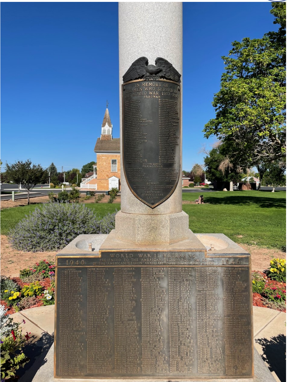
Plaque Number 2 (Front side bottom)