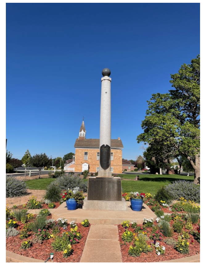
Plaque Number 1 (Front side Top):

Longitude: -112.828056; Latitude: 37.841111; Elevation 6030'; 50 South Main St. Parowan, Utah