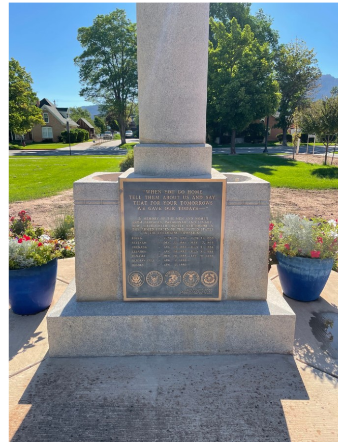
Plaque Number 3 (Back side)