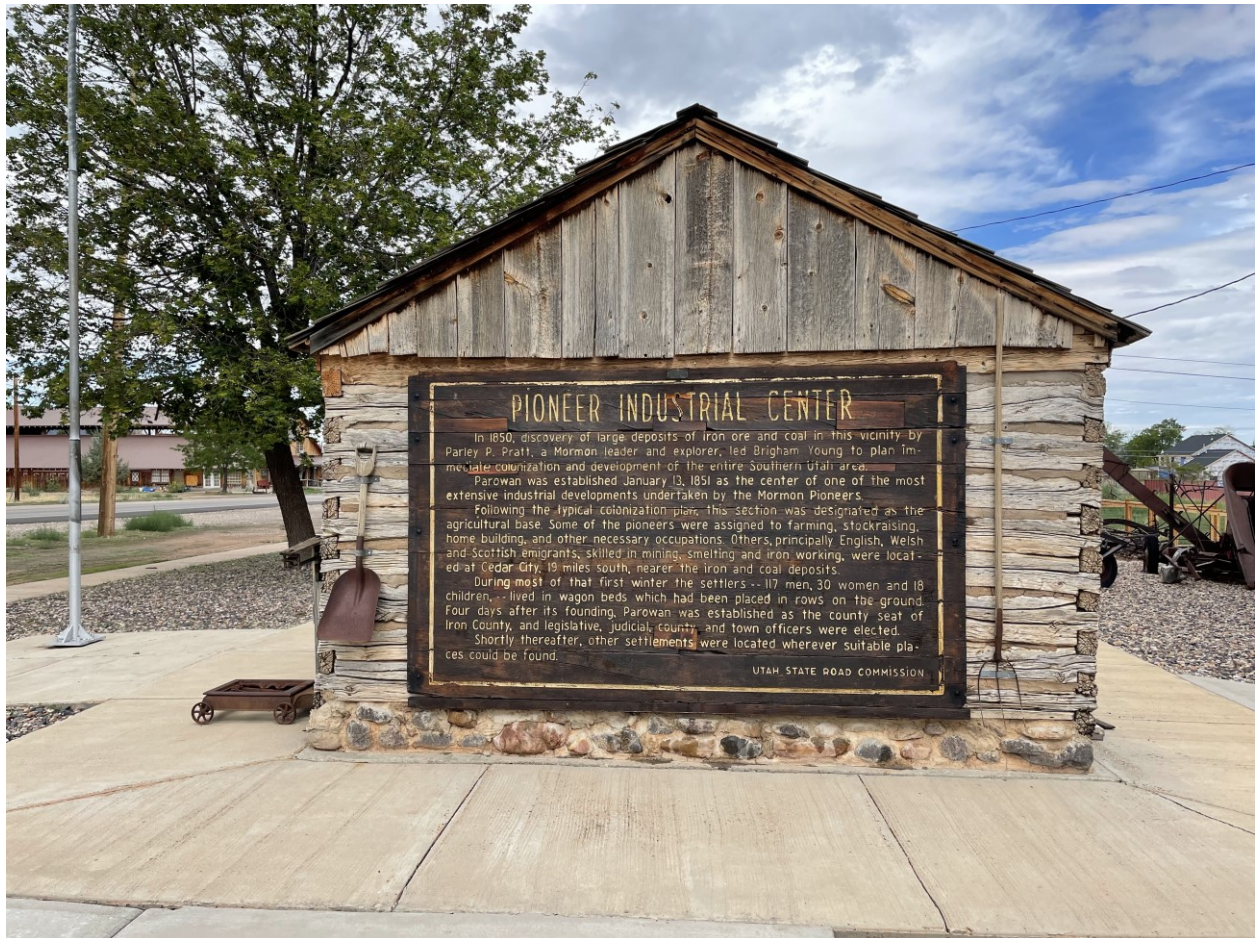
Pioneer Industrial Center

Longitude: -112.830556; Latitude: 37.839167; Elevation: 6030'; 100 West / 200 South, Parowan, Utah